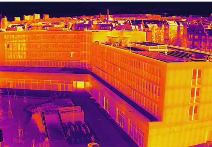
Left: Drone with thermal imaging camera in action.